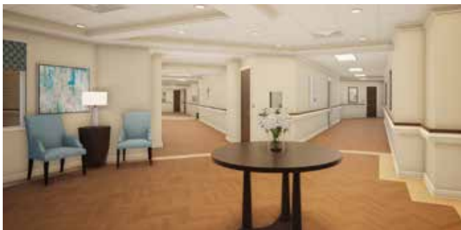
Rendering of New Lobby

Associate Director & Capital Project Manager