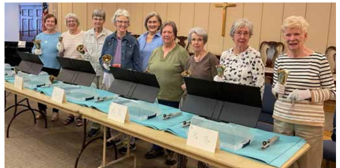
The Springmoor Ringers