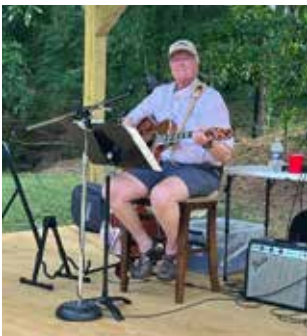
New Outdoor Stage

Each month, residents receive a detailed calendar and can choose to participate in the events and activities that interest them most. Just a few of the opportunities we provide on a regular basis include visits to local museums, games like croquet and shuffleboard, our Life Writing Workshop, attending sporting events, going out for lunch or dinner, Drumming for Life, lectures on fascinating topics in our auditorium, day trips to points of interest outside of the Triangle, classes from painting to fused glass in our Meraki Arts Studio, dozens of exercise classes, and a wide range of spiritual offerings.