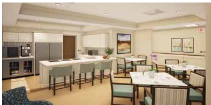
Rendering of New Dining Room

All this effort will result in a physical layout that facilitates our neighborhood model and allows residents to feel more at home in their surroundings. Staff will consistently work in the same neighborhood and “blend” roles to provide the best care for each individual and a nurturing, home-like environment within their neighborhood.