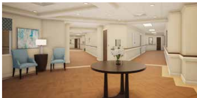
Rendering of New Lobby