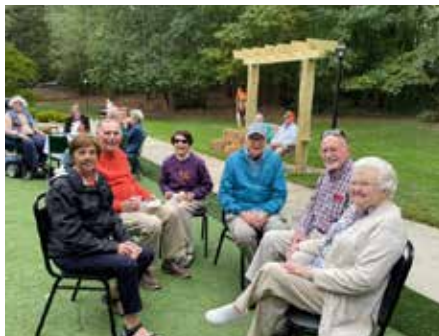
Happy Fall Y’all Event